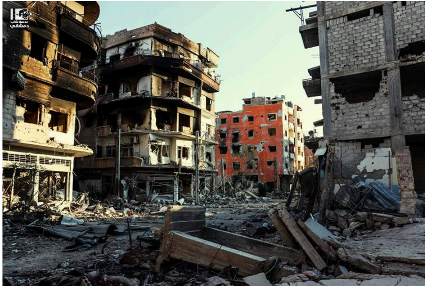
Photo 2: Destrutions in Darayya, a southern suburb of Damascus, on 19 January 2016

In areas under governmental control, destruction is non-existent, such as for example in the coastal town of Tartus, which is far removed from the combat zones; or it is limited, as is the case in the central districts of Damascus. In such cases, it results from rocket and mortar fire from armed opposition groups, or from bombs 19 . It therefore affects the urban fabric in a scattered and punctual manner. It is the districts on the edges of these zones that are the most affected.