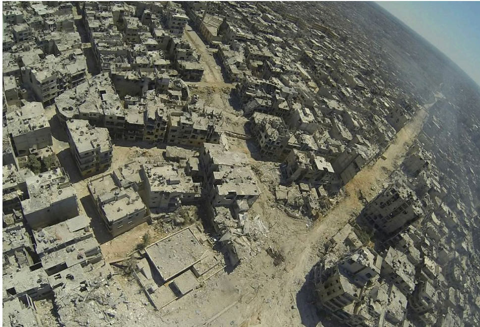
Photo 1: Impacts of bombings on the district of Khaldiyye in Homs in July 2013

maintaining a certain porosity between zones. This is however becoming increasingly limited as the conflict deepens.