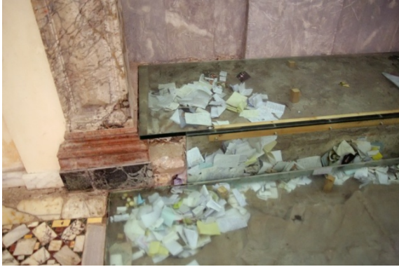
Written prayers and glass floor covering soil said to come from Jerusalem. Church of Santa Croce in Gerusalemme, Rome, Italy.

visitors, as Nagel argues, one where “the potential for time- and space-travel is actualized in the experience of users who assemble the elements creatively and thus, for a time, inhabit a space that is removed from their own environment, a space linked to Jerusalem through real conjunctures – the relics and the earth.” (p. 100-101)