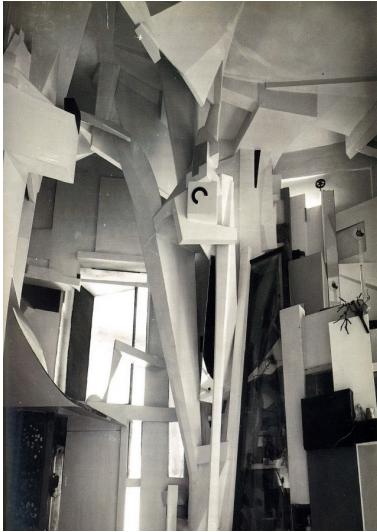
The Hannover Merzbau by Kurt Schwitters.